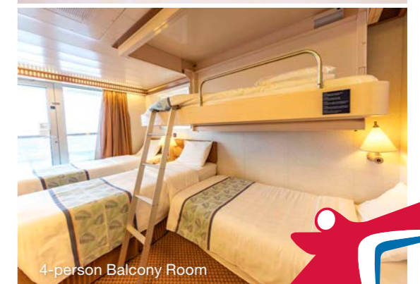
4-person Balcony Room